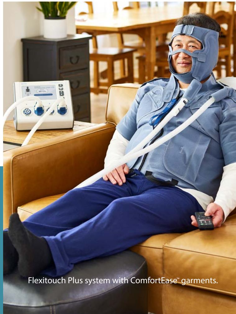
Flexitouch Plus system with ComfortEase™ garments.